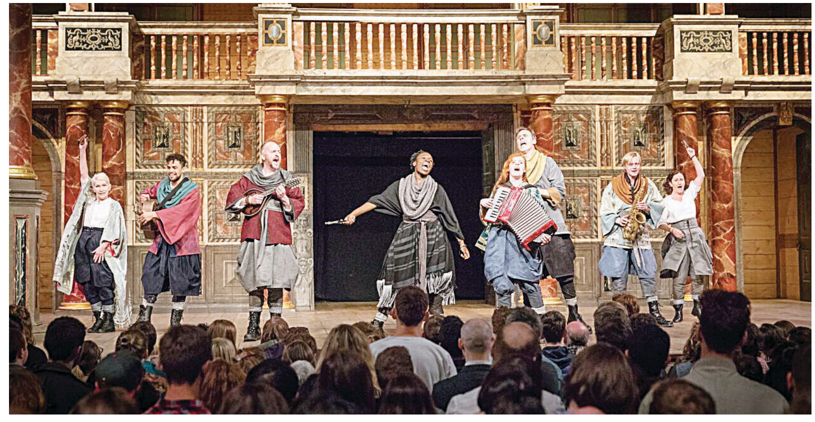
Shakespeare's Globe's upcoming season in Hong Kong features Merchant of Venice (above), Twelfth Night and The Taming of the Shrew.