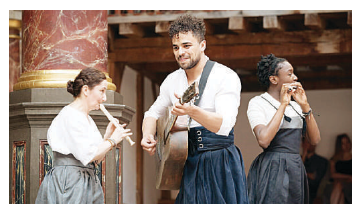
Globe's Hong Kong repertoire includes Twelfth Night, one of Shakespeare's most joyous and celebratory comedies.

t may well be argued that the original Globe Theatre's productions were the Elizabethan equivalent of gladiators facing off in Rome's Colosseum. Both were designed to entertain and both encouraged their audiences to participate by voicing their approval or disapproval of the action – often as loudly as possible.