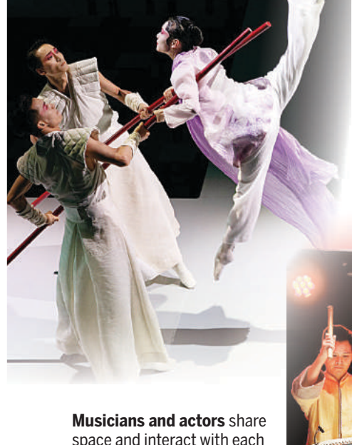
space and interact with each other in Hong Kong Dance Company's Waiting Heart.

Waiting Heart has Cantonese opera performers and dancers showcasing their respective skills simultaneously.